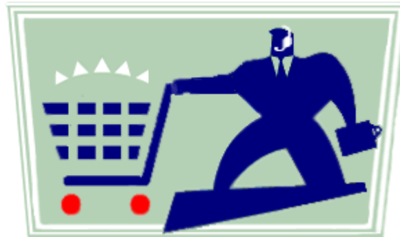
The Logistics Section is the hub for resources, staffing, communications: whatever it takes to get the job done.

The Logistics Section handles the practical day-to-day needs of the EOC. It also supports field operations by filling resource requests that cannot be met by others in the field or in the EOC. Of all the sections, the Logistics Section offers the greatest variety in job duties.